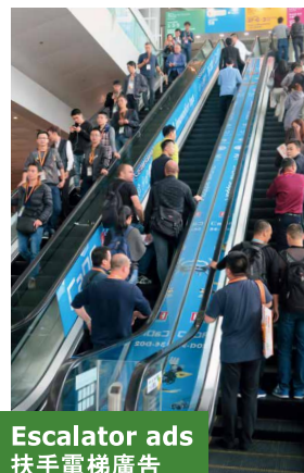
Escalator ads 扶手電梯廣告