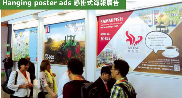
Hanging poster ads 懸掛式海報廣告