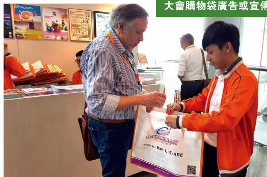
Tote bag ads or inserts 大會購物袋廣告或宣傳單張插放