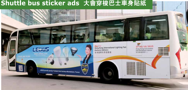
Shuttle bus sticker ads 大會穿梭巴士車身貼紙