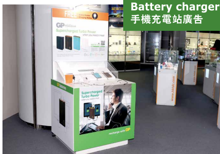
Battery charger ads 手機充電站廣告