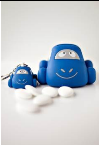
2G&E Ltd. (Hong Kong) Product Zone: World of Gift Ideas – Commercial Gift Ideas (Booth no:1B-B36) Website: www.2gne.com