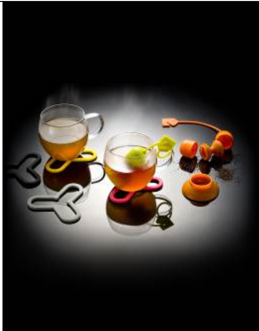
Kool Limited (Hong Kong) Product Zone: Hall of Fine Designs (Booth no:1D-B07) Website: www.kool.com.hk