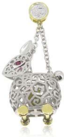
Hong Kong Oapes (Hong Kong) Product Zone: Jewellery Galleria (Booth no: M4-A42) Website: www.hkoapes.com