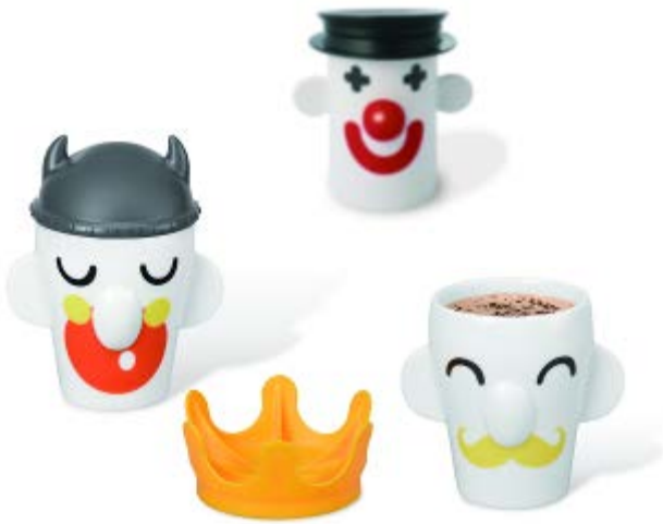
PO: Selected Company Limited (Hong Kong) Product Zone: Hall of Fine Designs (Booth no:1E-B03) Website: www.po-selected.com