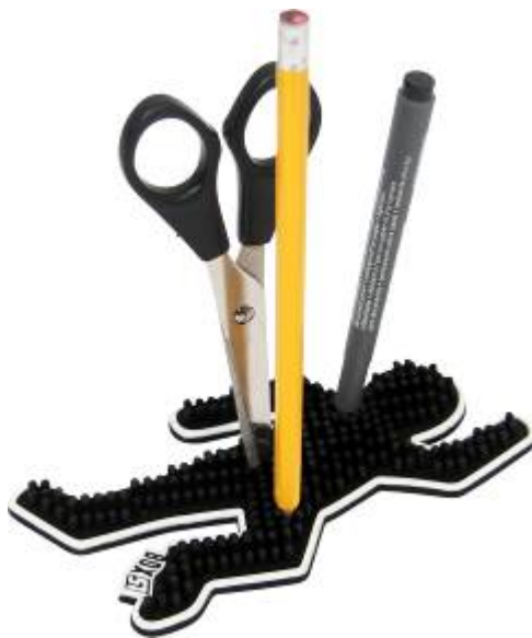
Paladone Products Ltd (Hong Kong) Product Zone: World of Gift Ideas – Commercial Gift Ideas (Booth no:1C-A25) Website: www.paladone.com