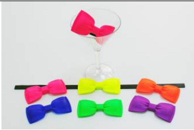
Kilovest (HK) Ltd (Hong Kong) Product Zone: World of Gift Ideas – Commercial Gift Ideas (Booth no: 1C-A38) Website: www.kilovest.com.hk