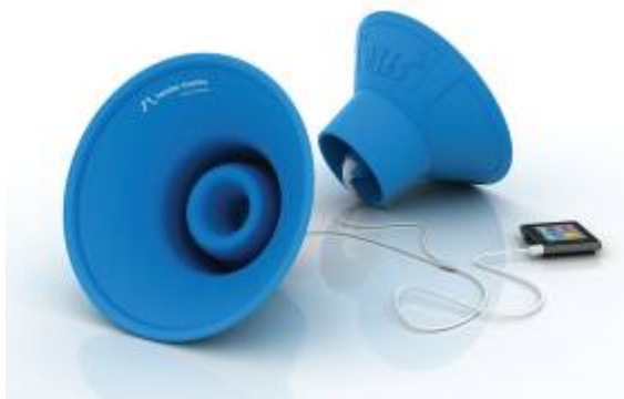
iTKOO Tech Limited (Hong Kong) Product Zone: World of Gift Ideas - Lifestyle Gift Ideas (Booth no: 1E-A39)