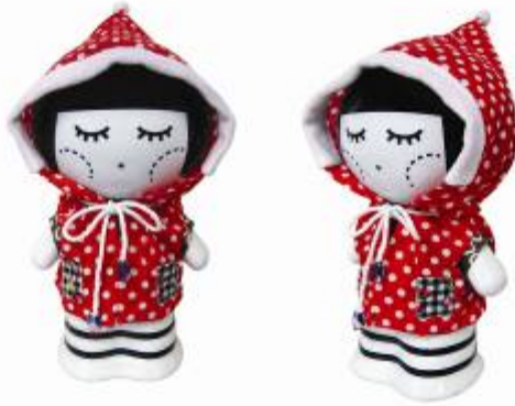
Chocolate Rain Jewelry & Design Company Limited (Hong Kong) Product Zone: Hall of Fine Designs (Booth no: 1E-F07)