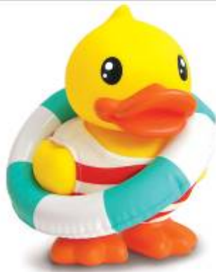
Semk Products Limited (Hong Kong) Product Zone: Hall of Fine Designs (Booth no: 1E-D02)