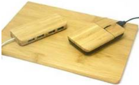
Del Ko Company (Hong Kong) Product Zone: Tech Gifts (Booth no: 3F-G32)