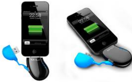
Hali-Power Industrial Company Limited (Hong Kong) Product Zone: Hall of Fine Designs (Booth no: 1E-D04)