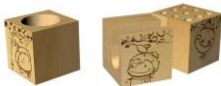
Asia One Product and Publishing Limited (Hong Kong) Product Zone: Hall of Fine Designs (Booth no: 1C-F06)