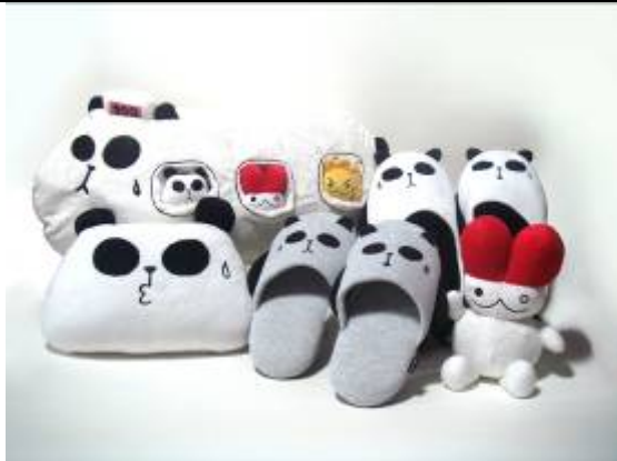
Trio Best International Limited (Hong Kong) Product Zone: Hall of Fine Designs (Booth no: 1C-E04)